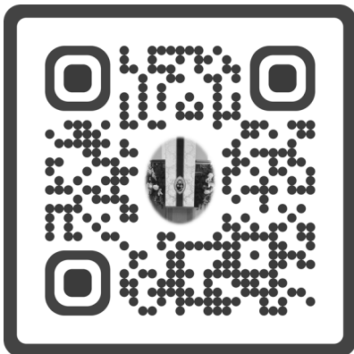
Lay Reader Training