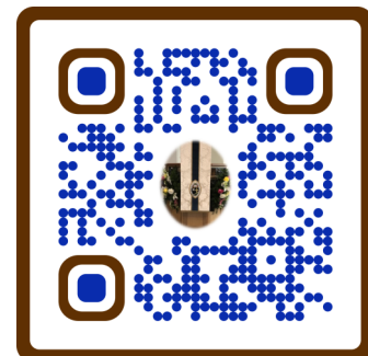
Lay Reader Training