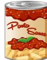
Pasta Sauce (in plastic or cans, please — no glass).

Thanks in advance! Questions? Contact Lisa.Clausen@verizon.net