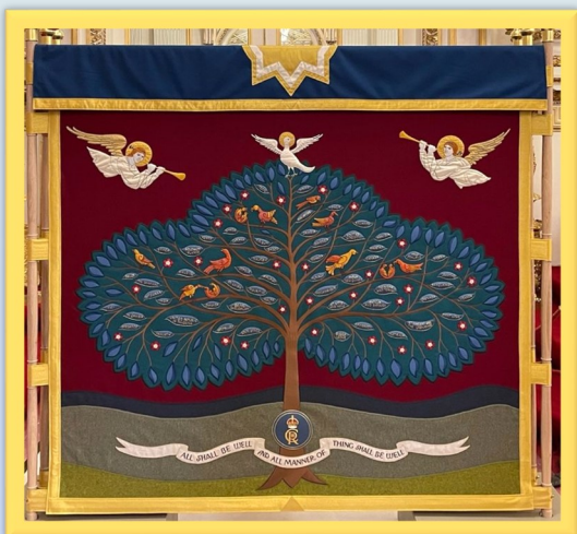
Photos of the Anointing Screen designed for the 2023 coronation of UK’s King Charles III