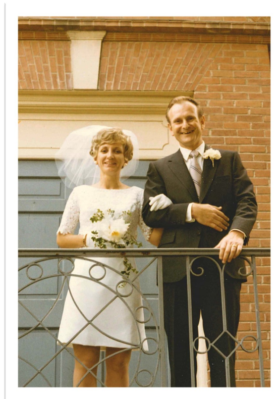
Rollin and Ann Huntington Zabriskie Chapel

Thank you all for your creative, beautiful story submissions, patience, and understanding.