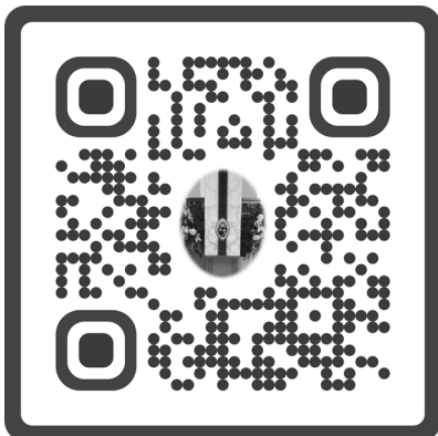
Lay Reader Training