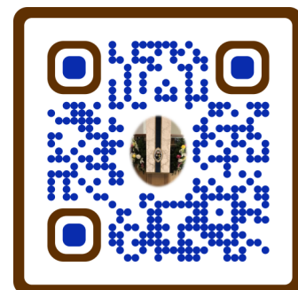
Lay Reader Training