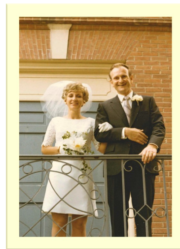
Rollin and Ann Huntington Zabriskie Chapel

Send in all of your favorite photos of Baptisms, Weddings, Confirmations and Homecoming Services taken at Seminary Chapel, Seminary Memorial Garden Chapel, and Zabriskie Chapel. We'll take a look back at how Seminary Chapel is still with us and how that sacred space is still used today; along with a nostalgic look at special sacraments, and events that took place at Zabriskie. Deadline for entries is May 15, 2022.