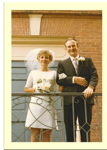
Rollin and Ann Huntington Zabriskie Chapel

Send in all of your favorite photos of Baptisms, Weddings, Confirmations and Homecoming Services taken at Seminary Chapel, Seminary Memorial Garden Chapel, and Zabriskie Chapel. We'll take a look back at how Seminary Chapel is still with us and how that sacred space is still used today; along with a nostalgic look at special sacraments, and events that took place at Zabriskie. Deadline for entries is May 15, 2022.