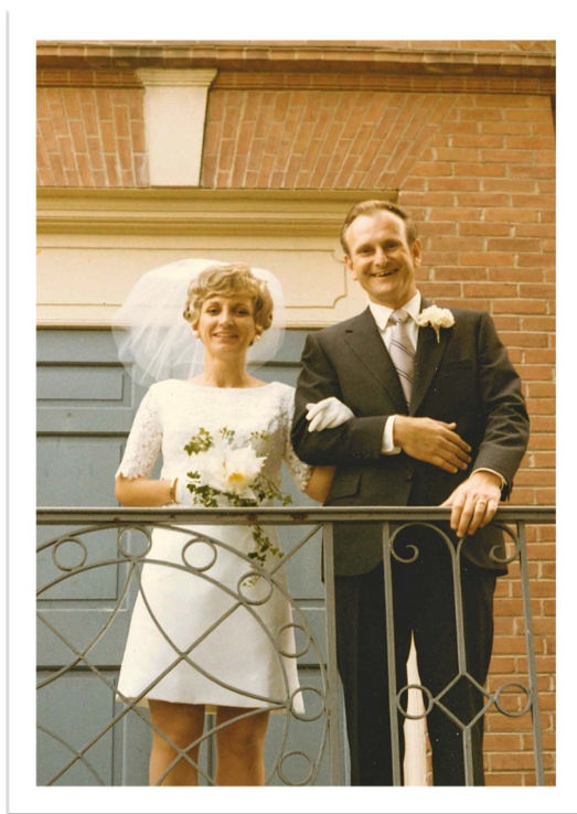
Rollin and Ann Huntington Zabriskie Chapel

Thank you all for your creative, beautiful story submissions, patience, and understanding.