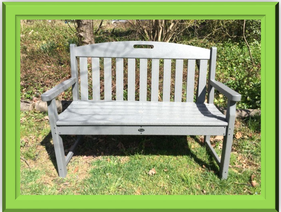
Our Creation Care Team is happy to present Immanuel's new Tex bench, created from 500lbs. of recycled plastic bags. See update on page 3.