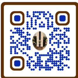
Lay Reader Training

Our next month to donate food will be June 2024.