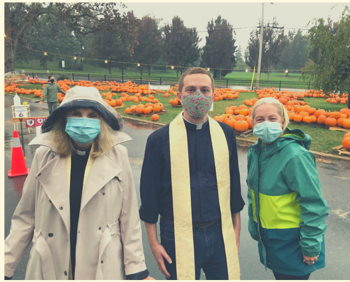
Let the favour of the Lord our God be upon us, and prosper for us the work of our hands. Psalm 90:17